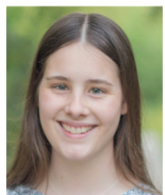
Fukuoka-shi, Fukuoka 810-0029 Japan